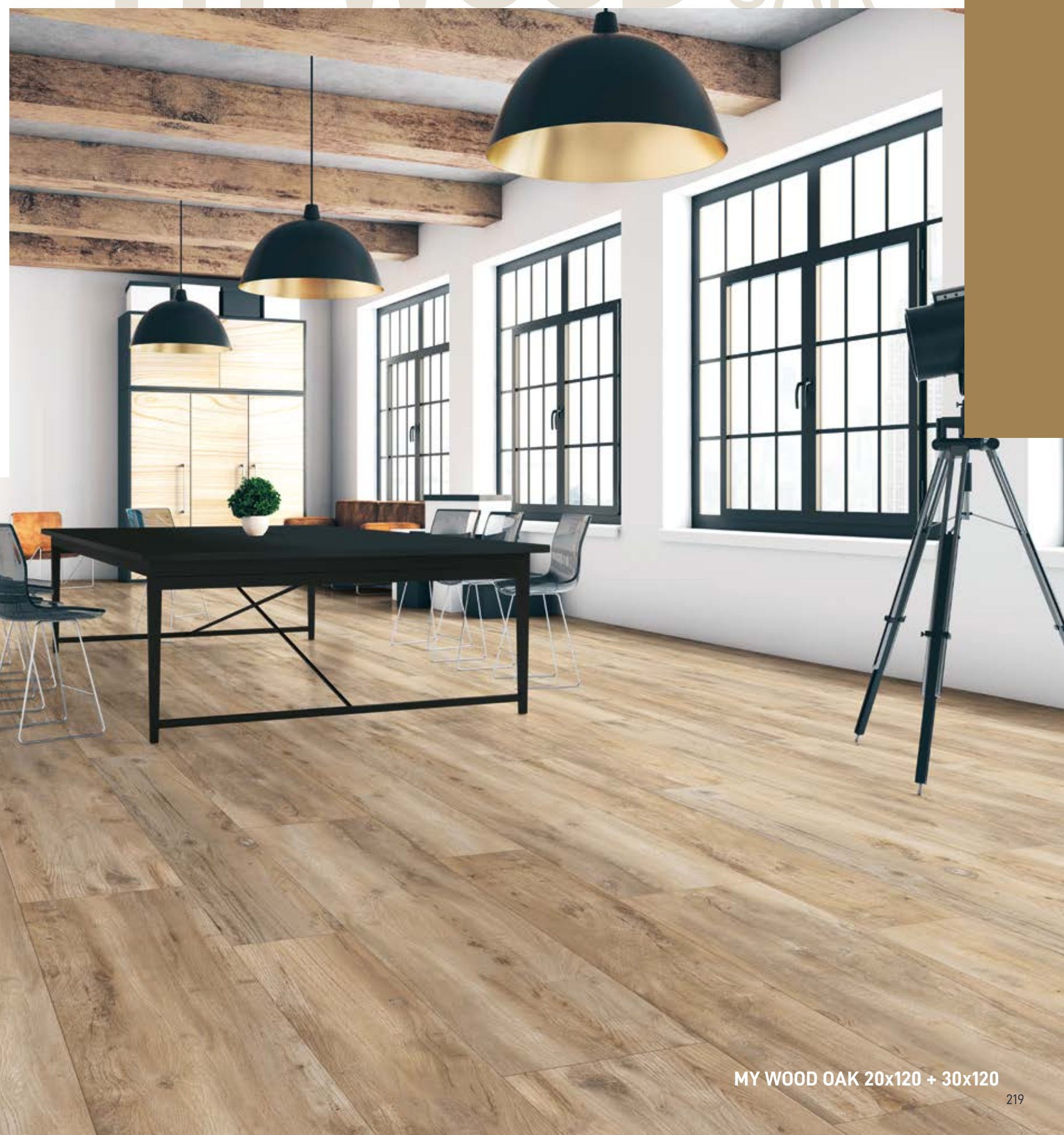
MY WOOD OAK 20x120 + 30x120