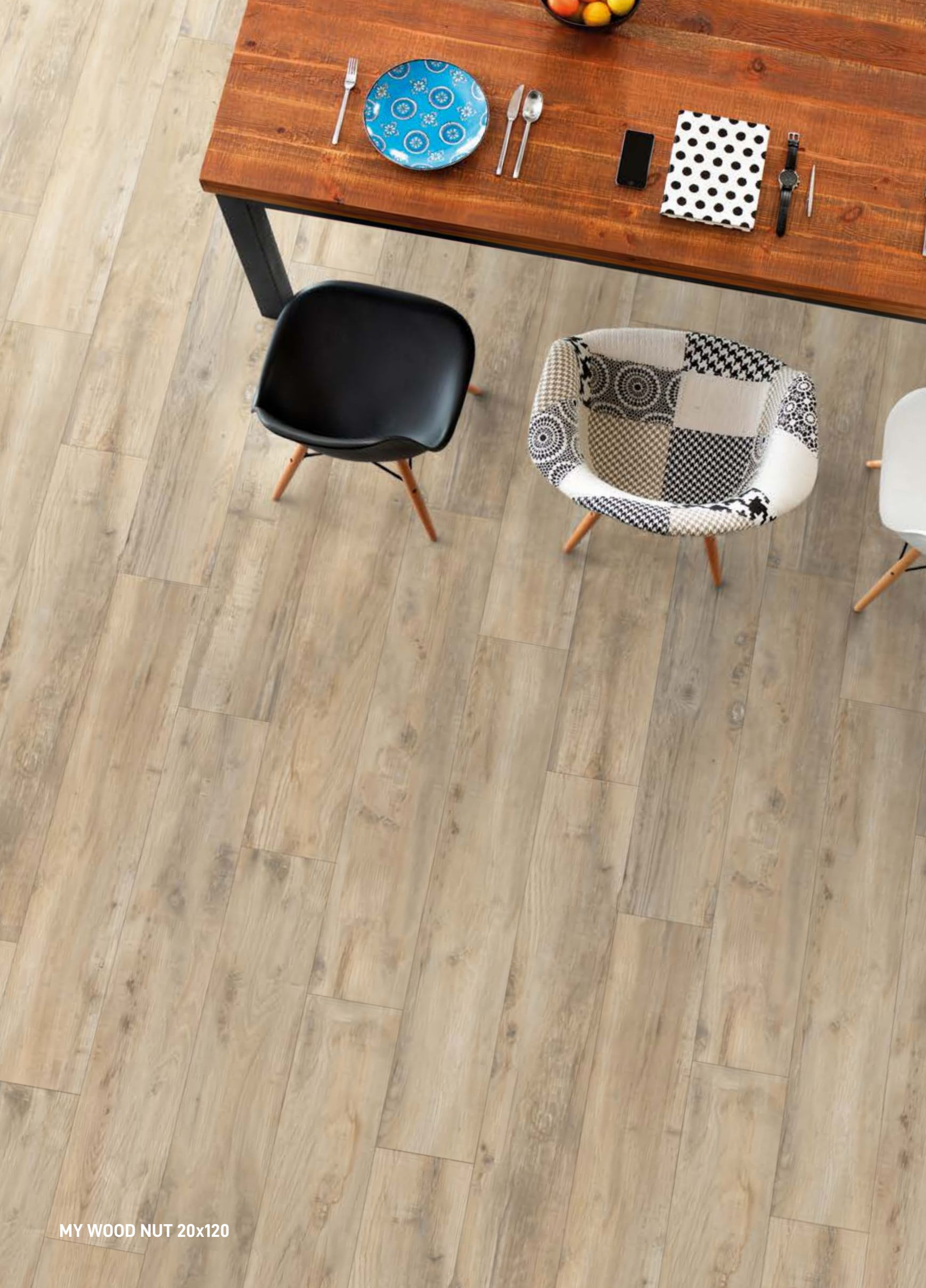
MY WOOD NUT 20x120