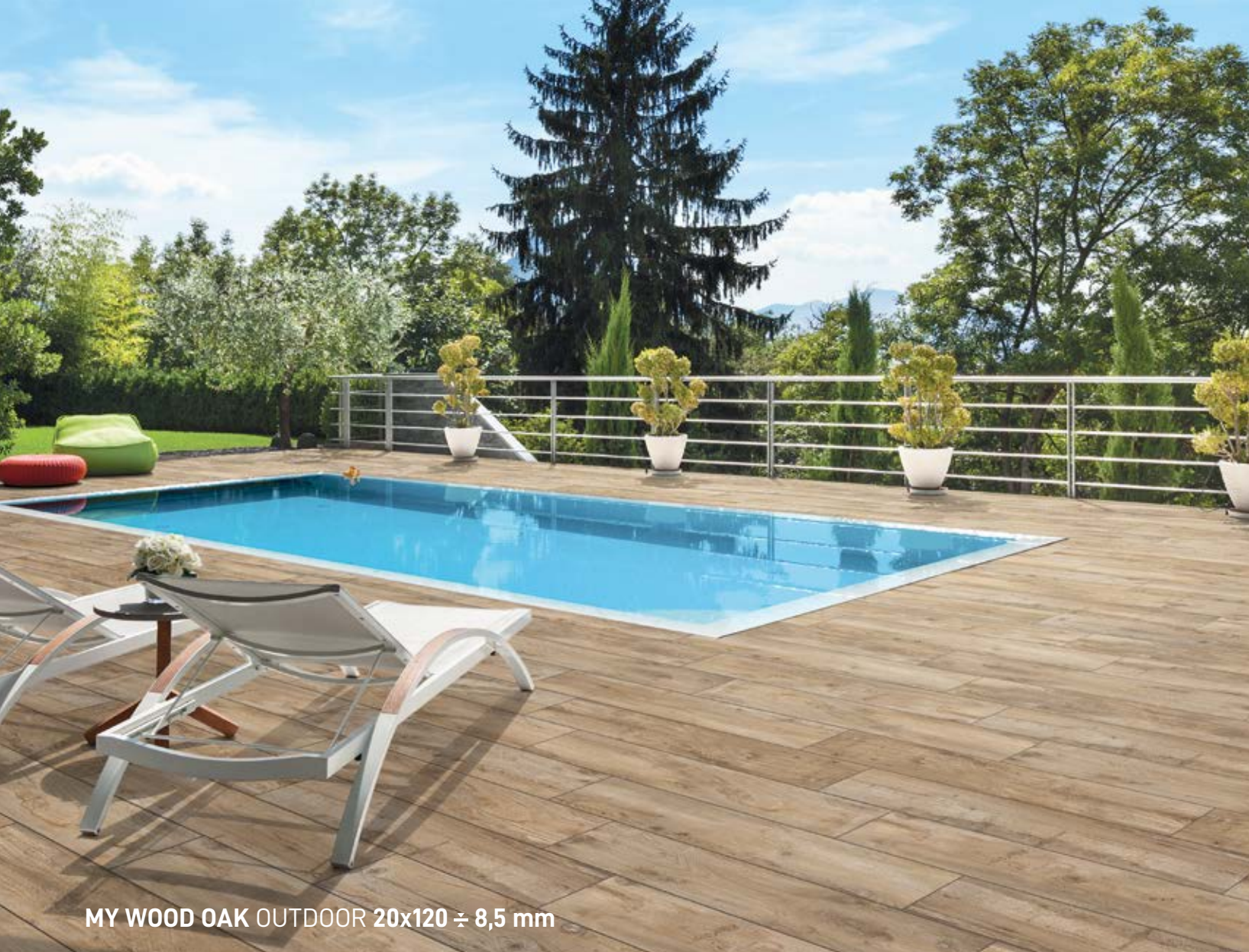
MY WOOD OAK OUTDOOR 20x120 ÷ 8,5 mm