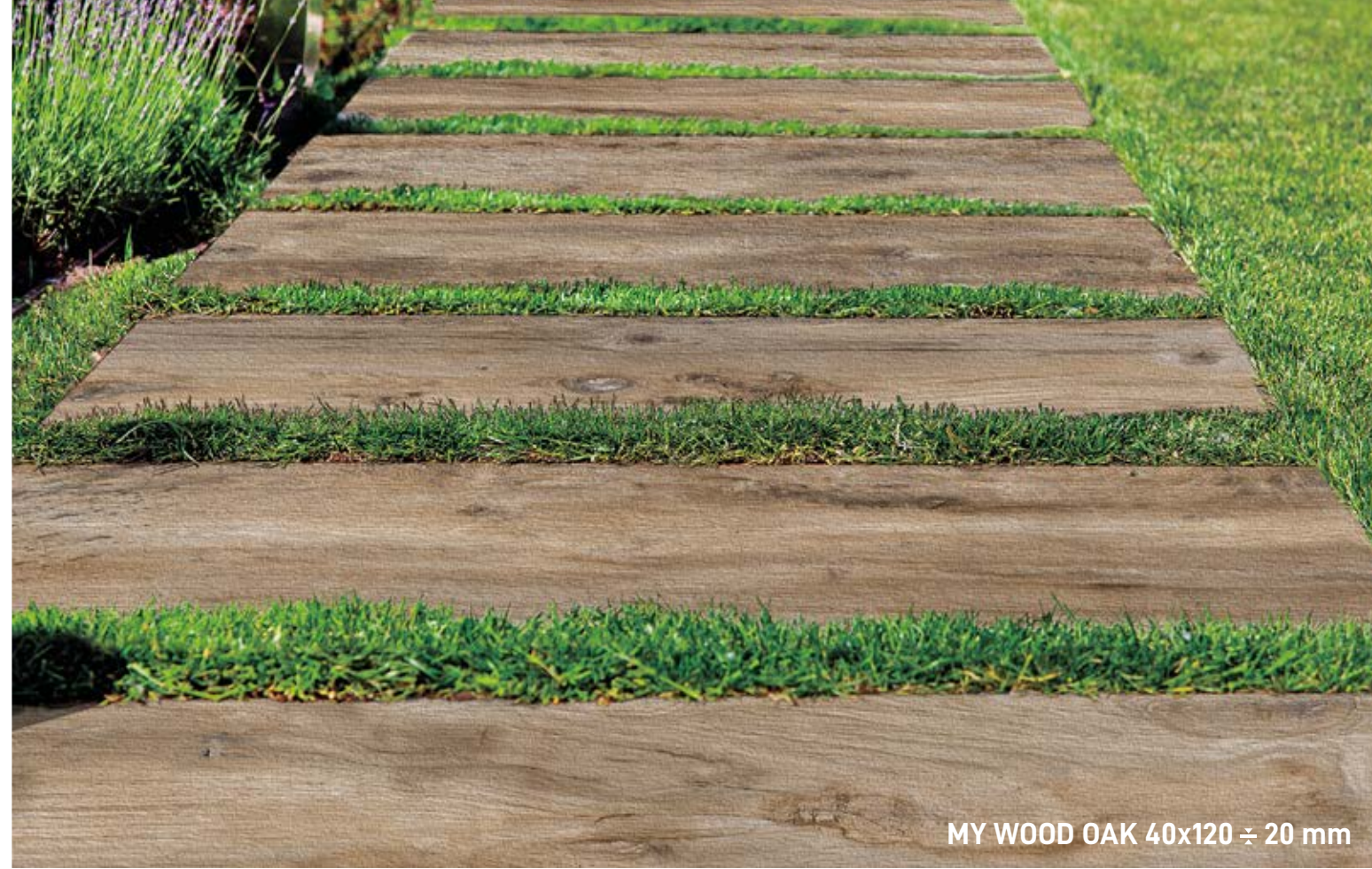
MY WOOD OAK 40x120 \div 20 mm