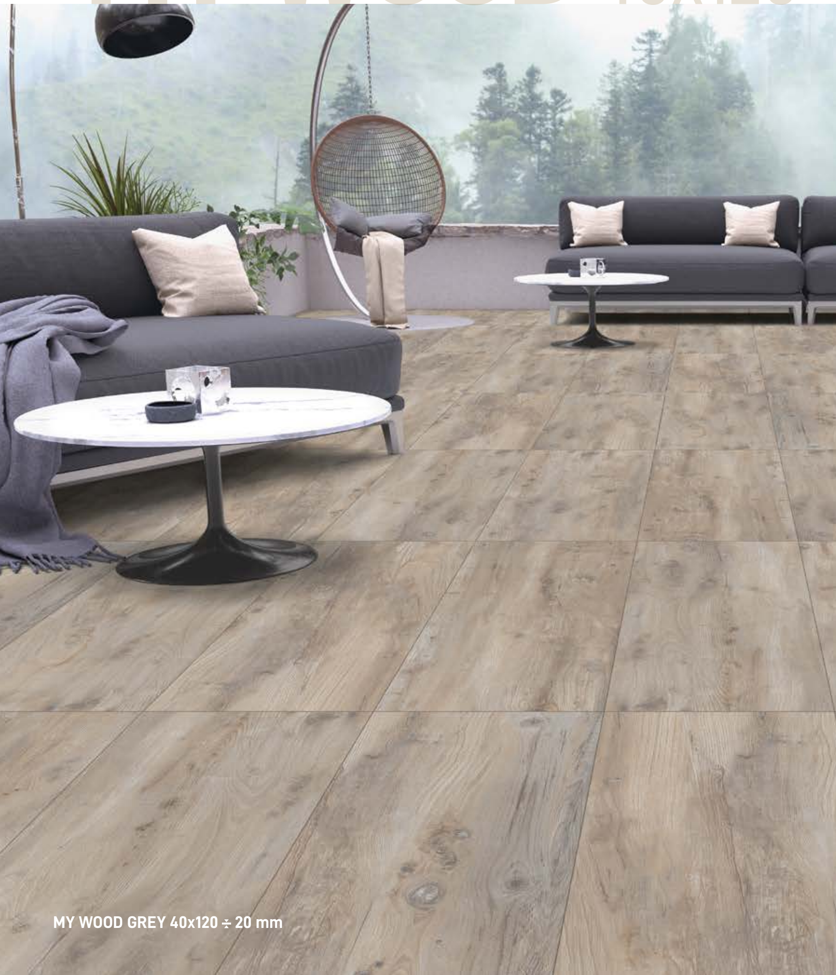
MY WOOD GREY 40x120 \div 20 mm