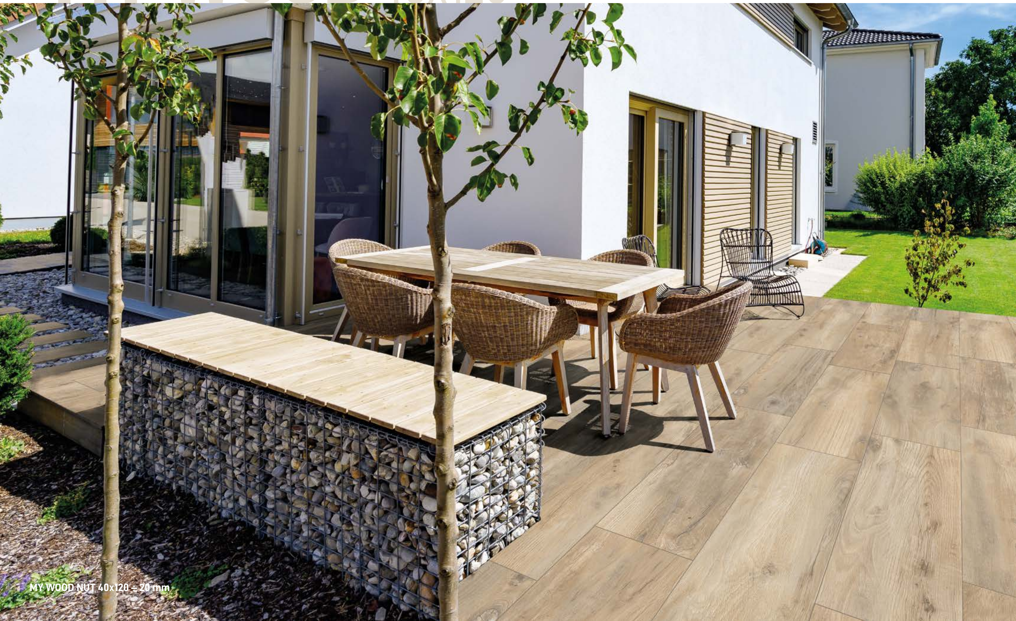
MY WOOD NUT 40x120 ✦ 20 mm